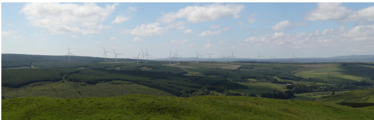
Knockodhar Wind Farm viewed from Auchensoul Hill

Knockodhar Wind Farm (50MW) is a new wind farm proposal adjacent to the village of Pinwherry, 3.5 km south-west of Barr, in South Ayrshire. It consists of 16 x wind turbines (149.9 m - 200 m high to blade tip), a substation (132 kilovolt), an energy storage system (ESS) and compound.