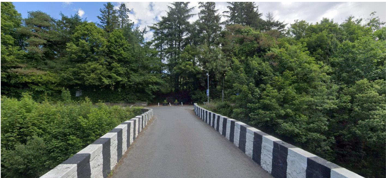
The southernmost junction at the Pinwherry bridge for abnormal indivisible loads (AIL).